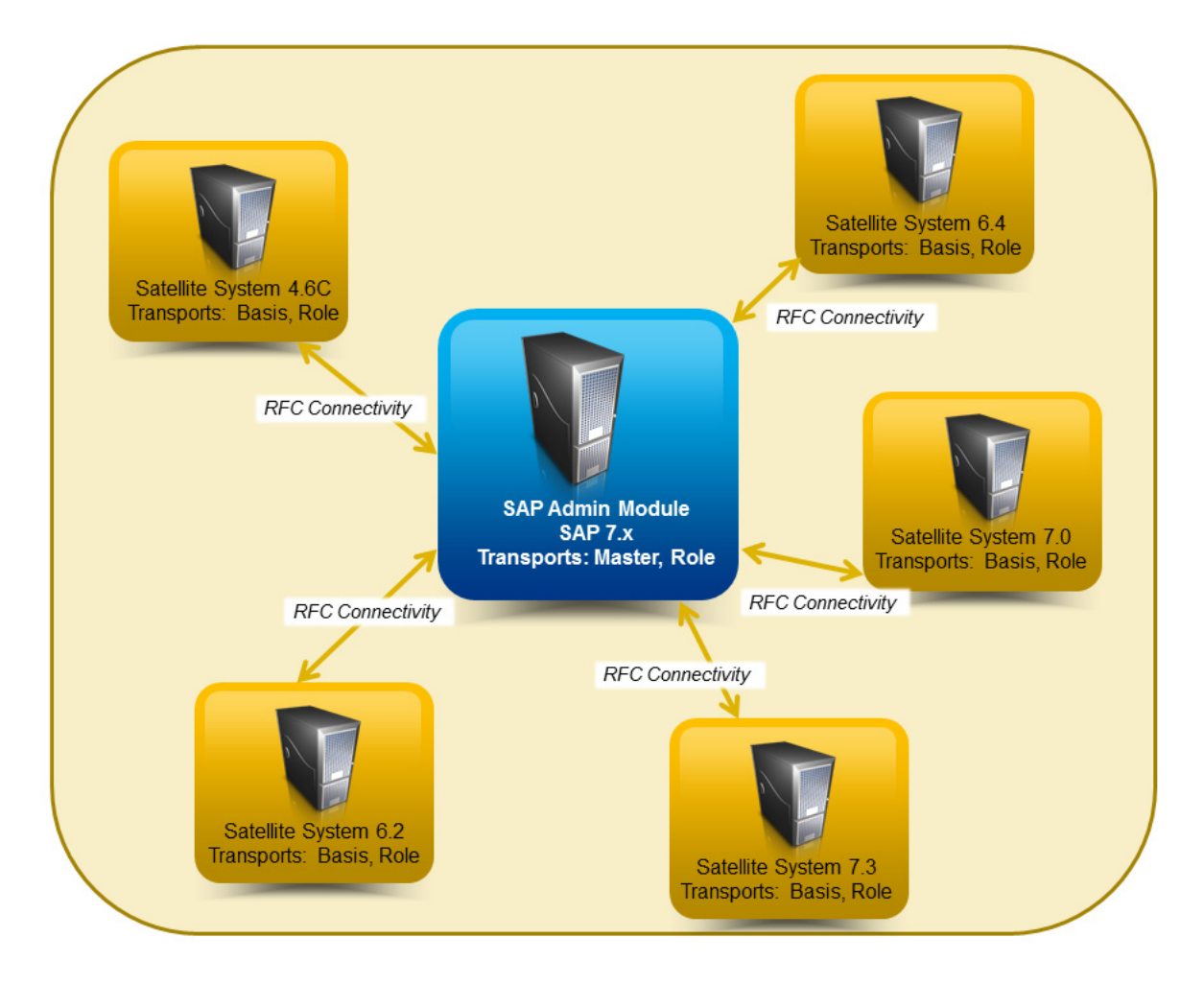
Figure 2: Transports for FlexNet Manager for SAP Applications in the SAP system landscape